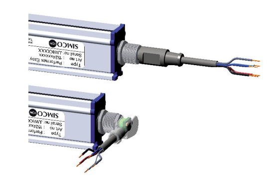
Straight connector with cable

Cable with angled connector with integrated function control LED's