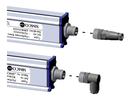
Separate connector, straight or angled